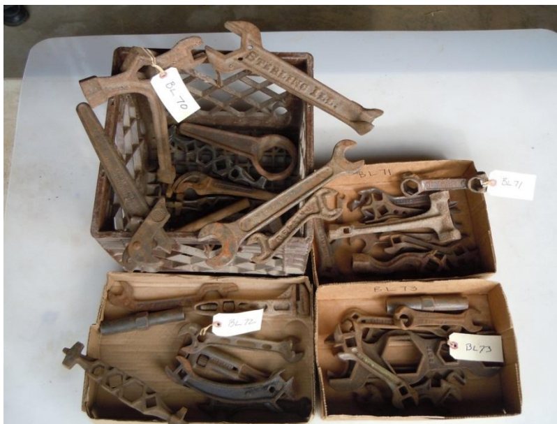
BOX LOTS 70-73