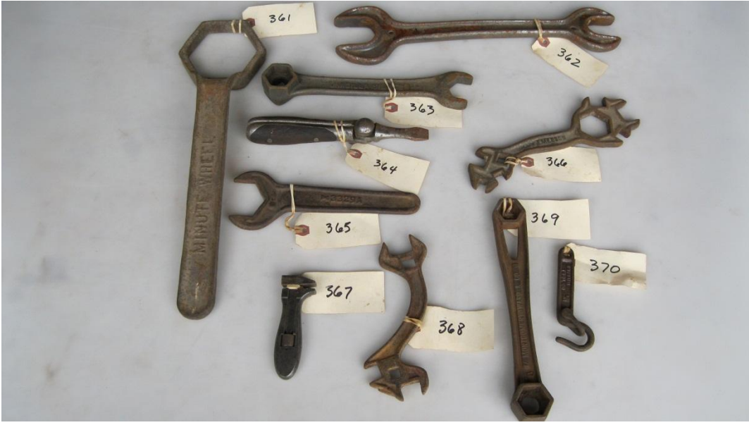
IND. LOTS 361-370