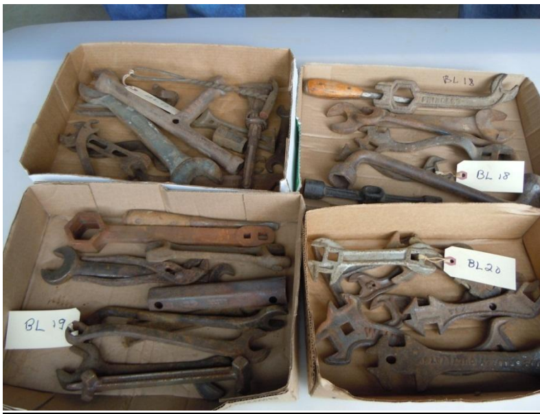
BOX LOTS 17-20