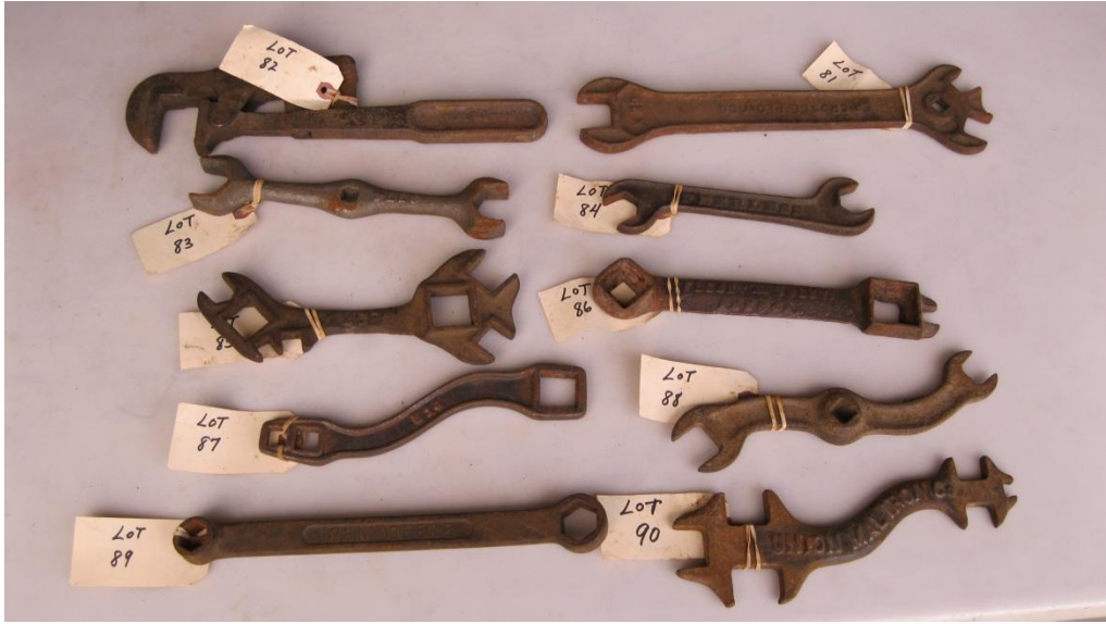
IND. LOTS 81-90