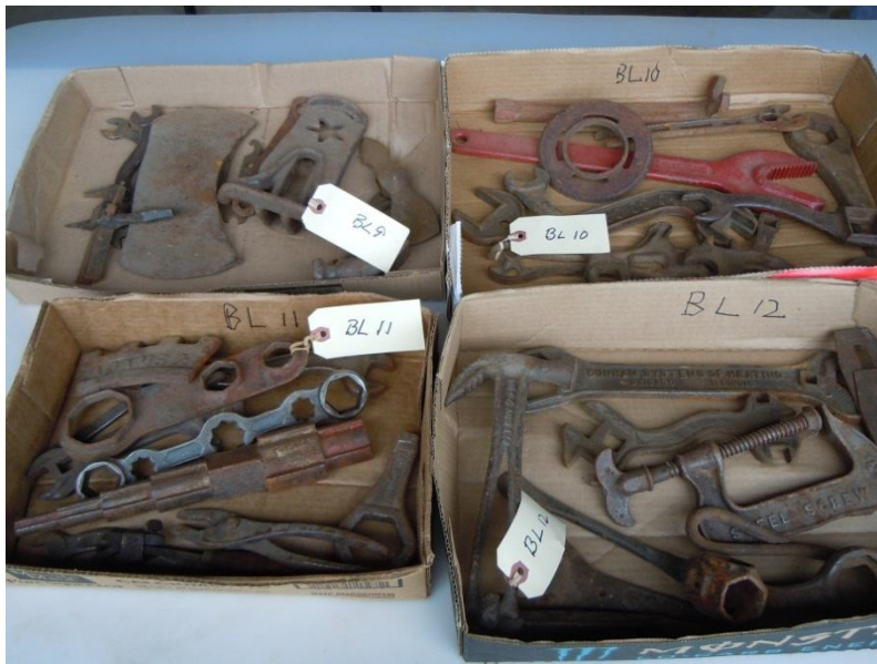
BOX LOTS 9-12