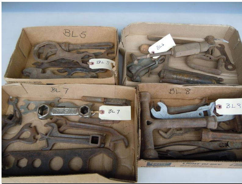
BOX LOTS 5-8