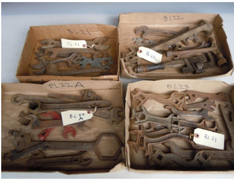
BOX LOTS 21-23