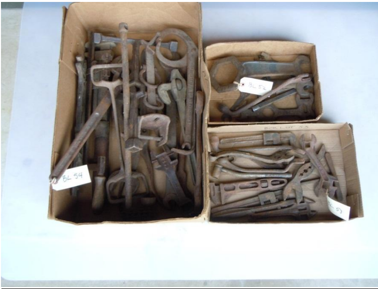
BOX LOTS 52-54