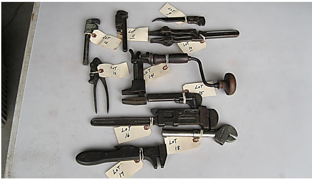
IND. LOTS 9-18