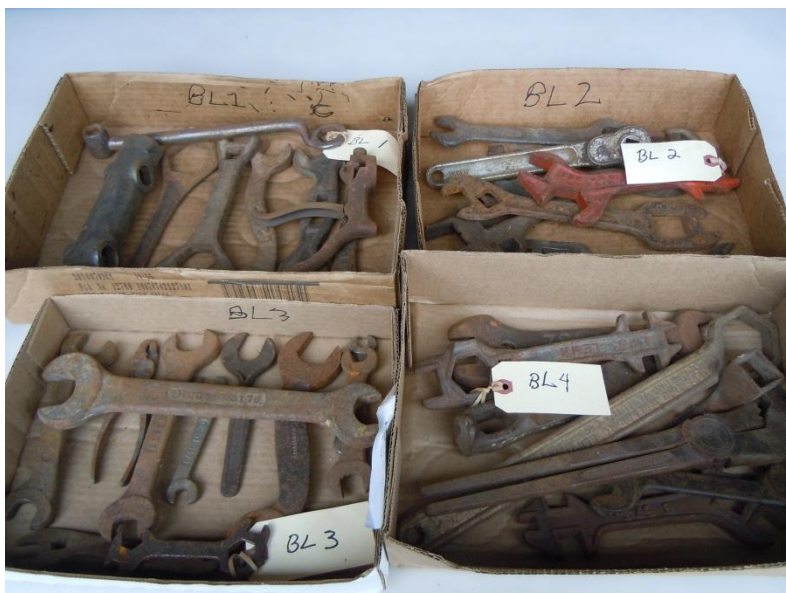
BOX LOTS 1-4