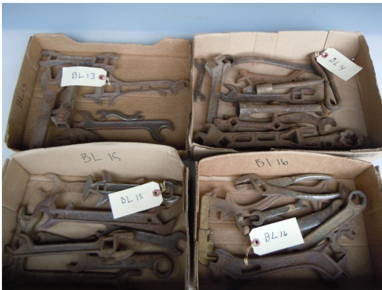
BOX LOTS 13-16