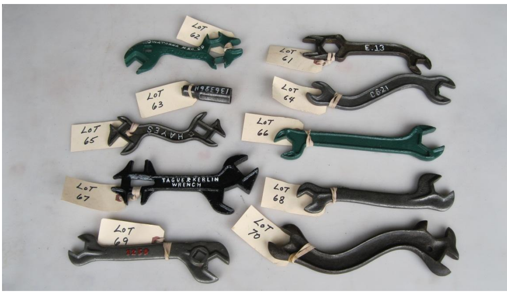
IND. LOTS 61-70