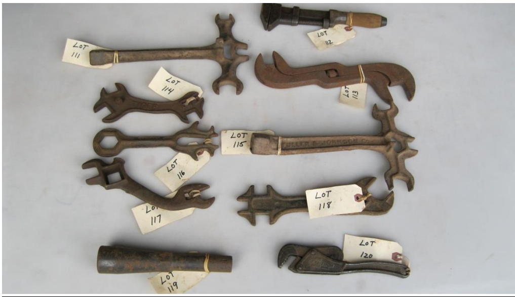
IND. LOTS 111-120