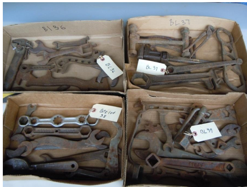
BOX LOTS 36-39