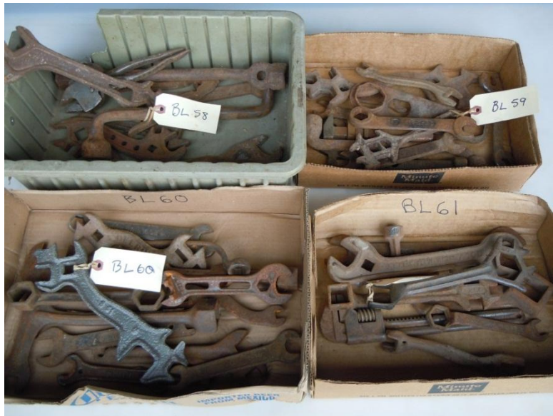
BOX LOTS 58-61