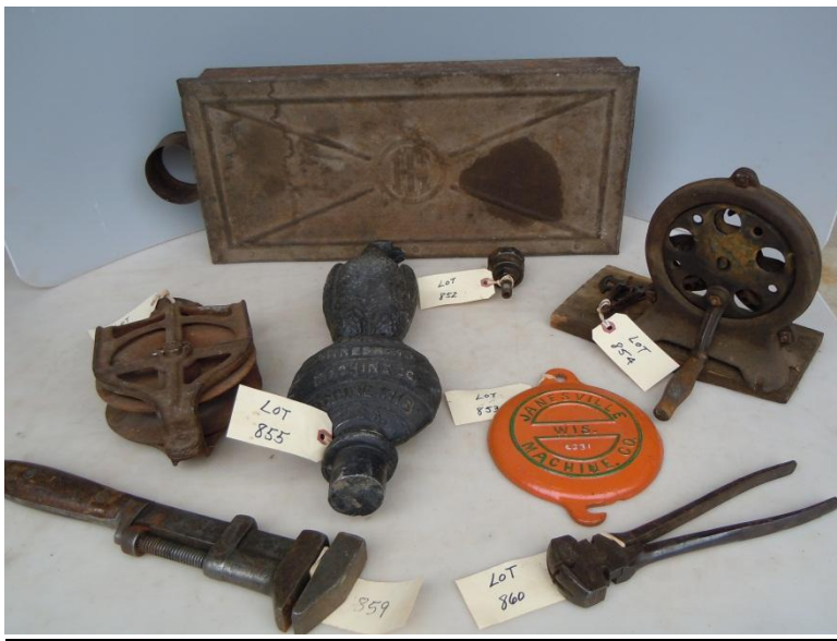
IND.LOTS 851-856, 859-860