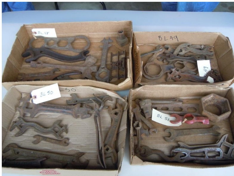
BOX LOTS 48-51