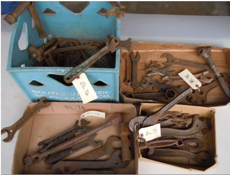
BOX LOTS 74-77