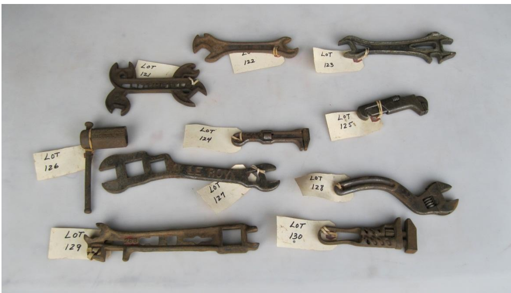
IND. LOTS 121-130