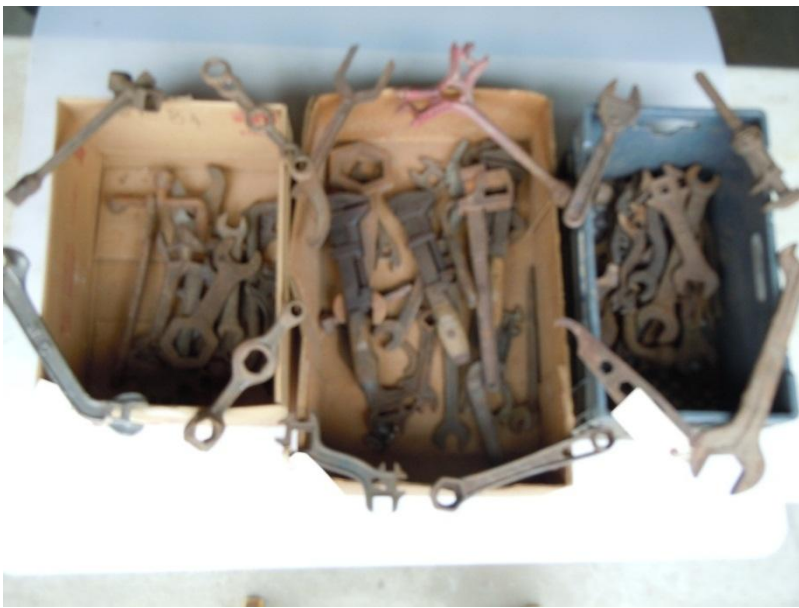
BOX LOTS 82-84