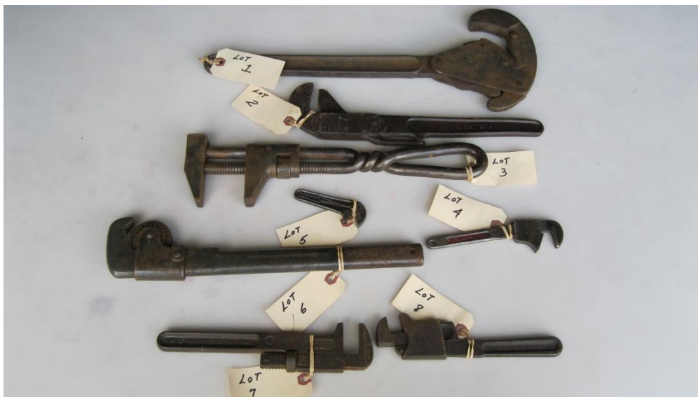
IND. LOTS 1-8