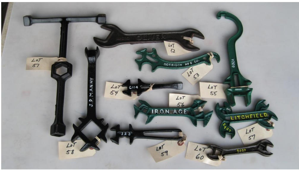
IND. LOTS 51-60