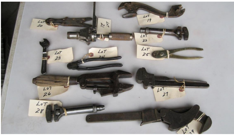
IND. LOTS 19-29