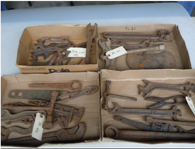
BOX LOTS 40-43