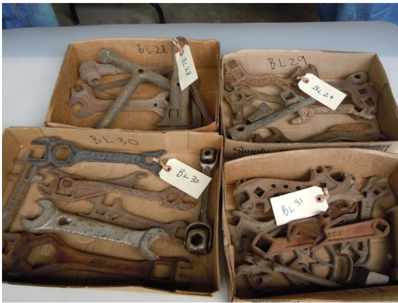
BOX LOTS 28-31