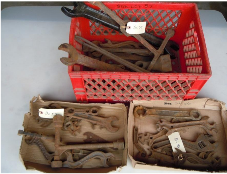
BOX LOTS 55-57