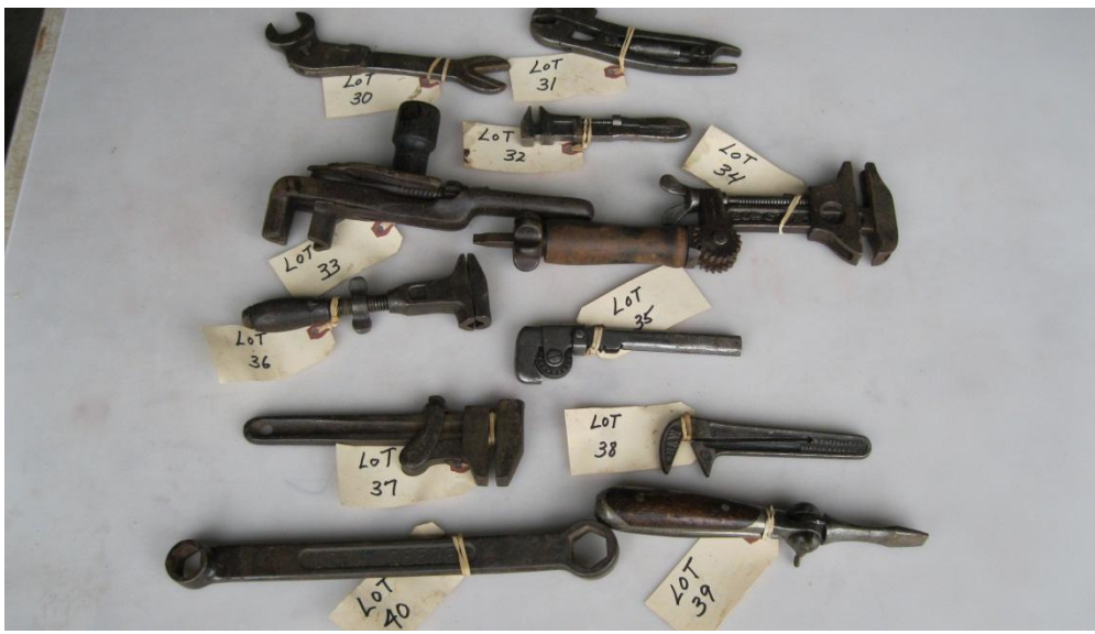
IND. LOTS 30-40