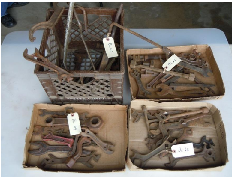
BOX LOTS 62-65