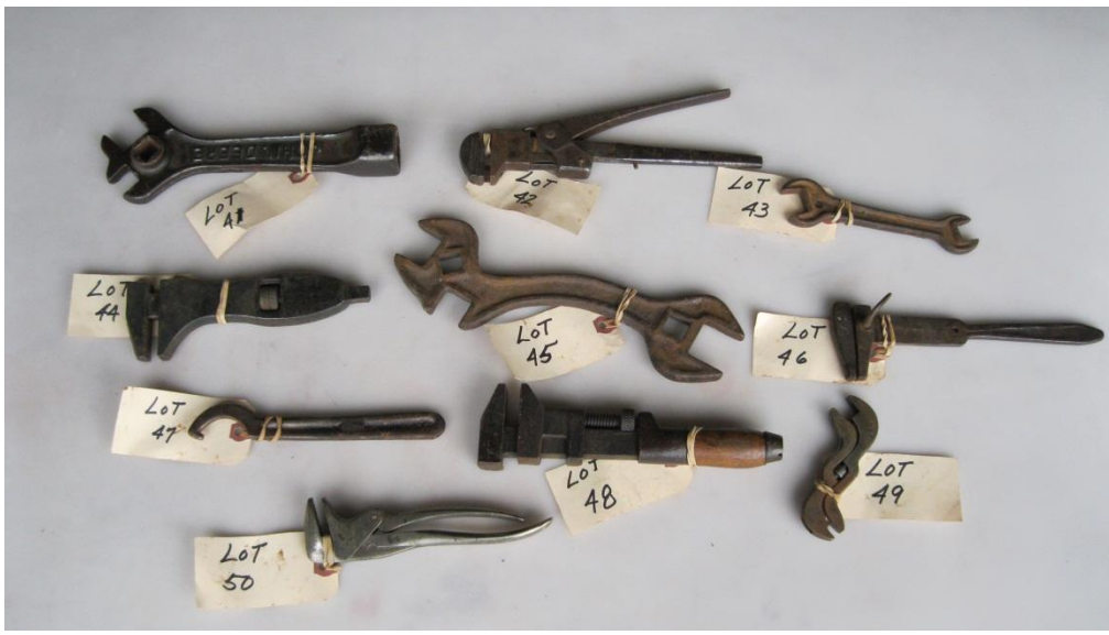
IND. LOTS 41-49