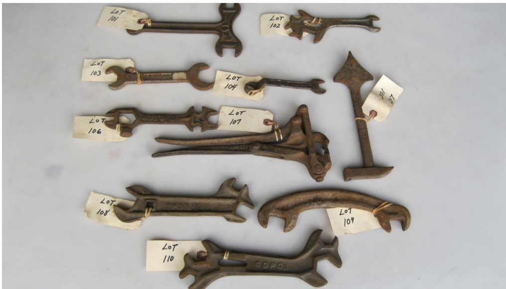
IND. LOTS 101-110