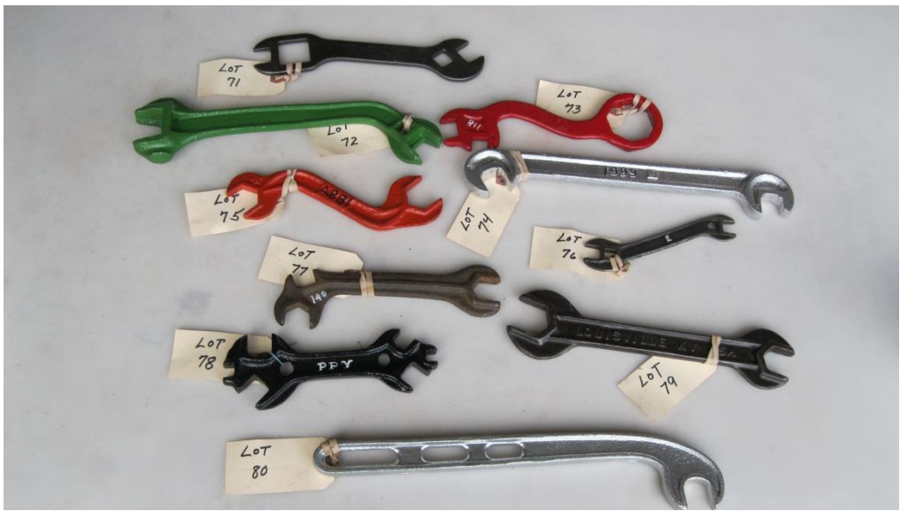
IND. LOTS 71-80