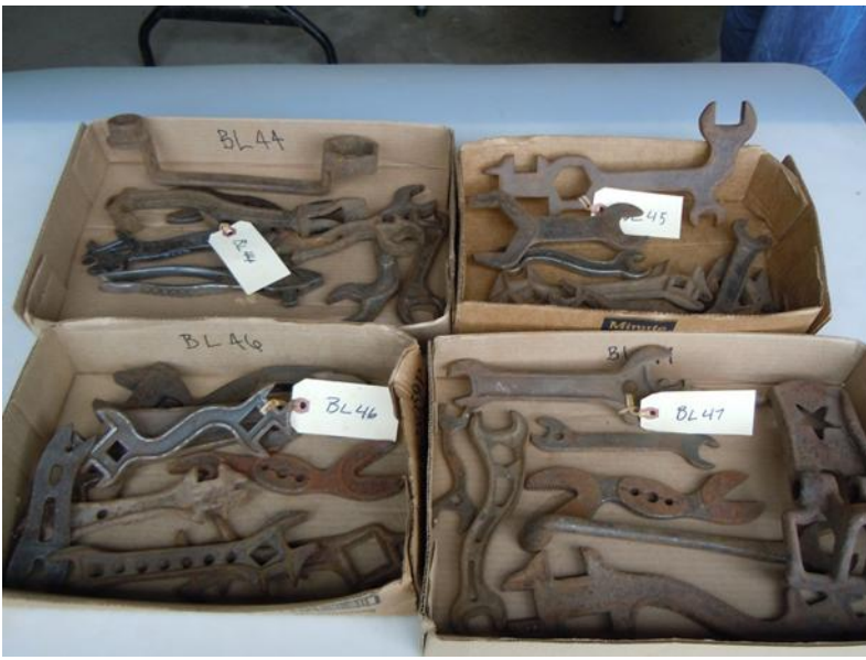
BOX LOTS 44-47