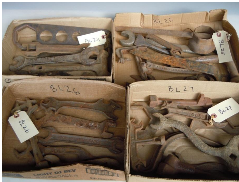
BOX LOTS 24-27