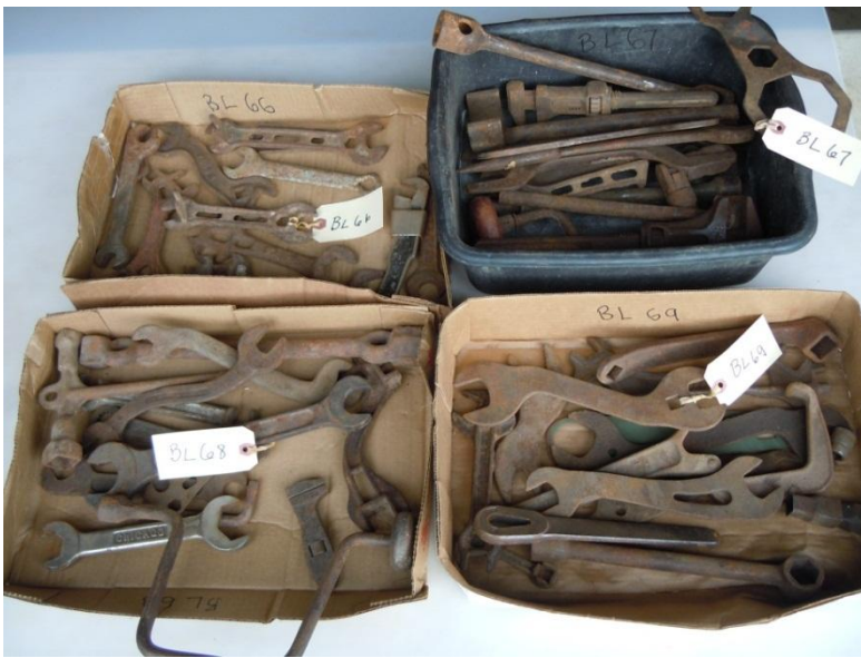
BOX LOTS 68-69