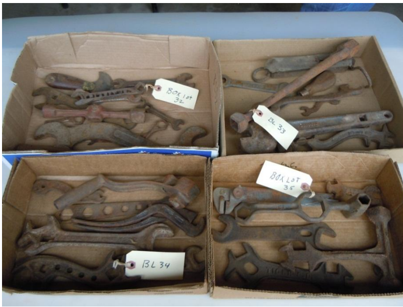
BOX LOTS 32-35